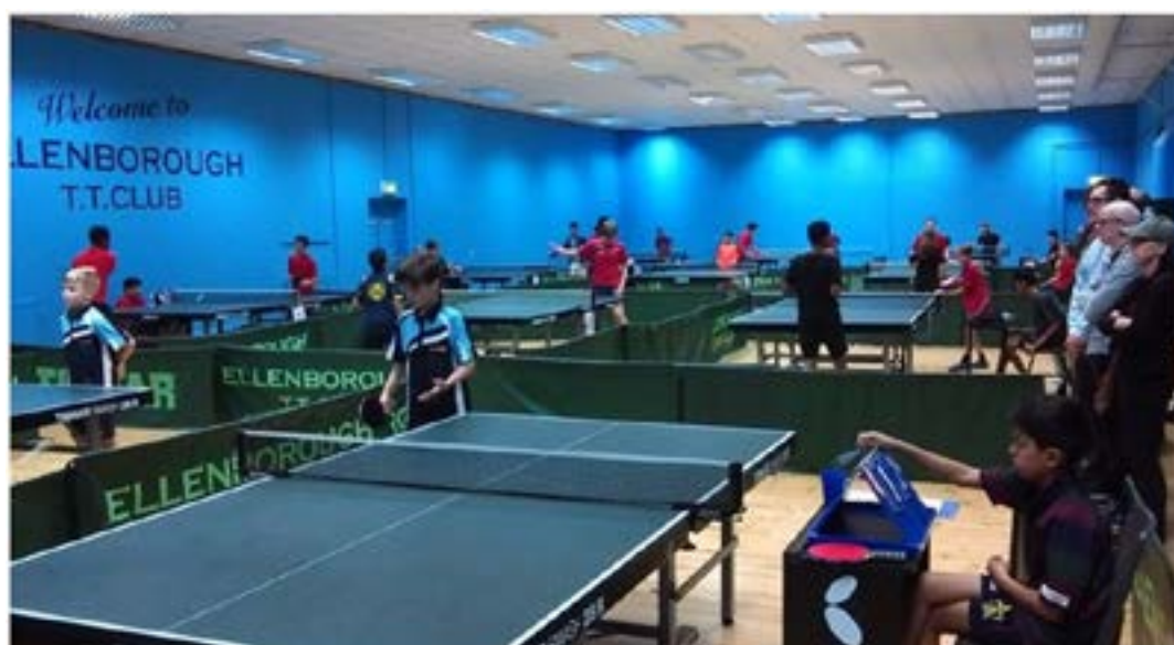
Play at Ellenborough during London North NCL