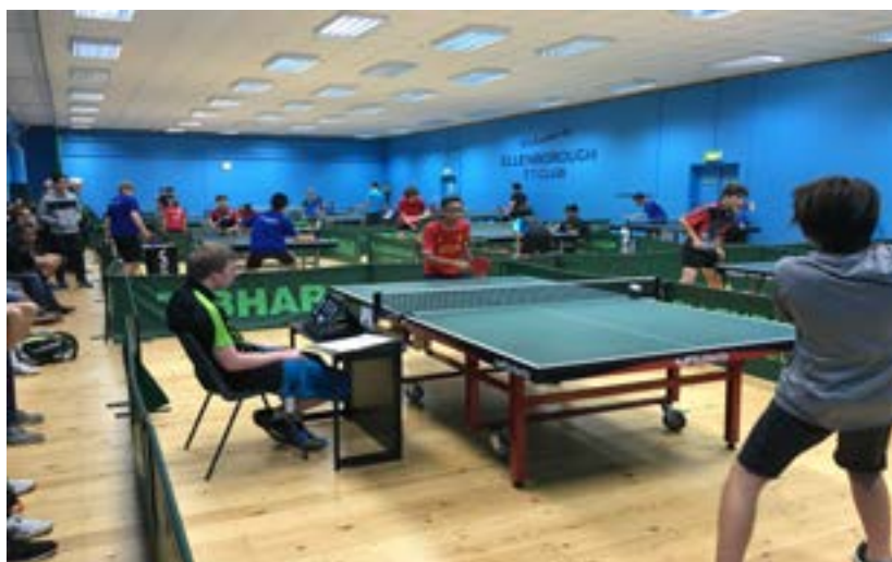
The Scene at Ellenborough During Day 1 of Competition